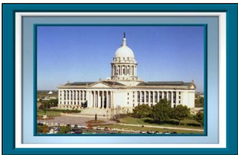
Oklahoma State Legislature